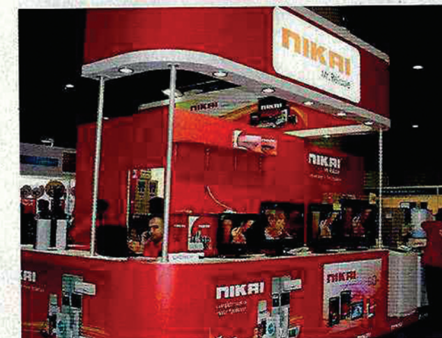
▲ Nikai has a customer base of more than 60 million people

Nikai has been recognised as a Superbrand and has won many accolades like the Dubai Quality Award, ISO Excellence award, the prestigious Sheikh Khalifa Excellence Award and another Superbrands title for the year 2017/18. Following the success in the Middle East, the brand plans to expand into the western markets later this year.